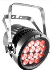
COLORADO TRI TOUR