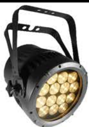
COLORADO 2-QUAD ZOOM IP