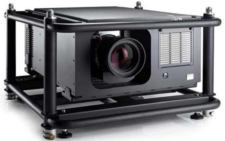
BARCO RLM W12