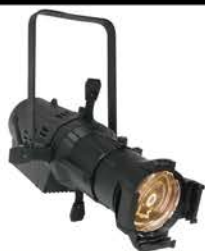
OVATION ED-190WW LED