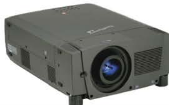
CHRISTIE'S ROADRUNNER L8