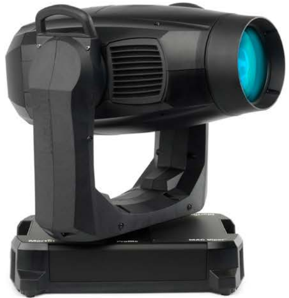
MAC VIPER PERFORMANCE