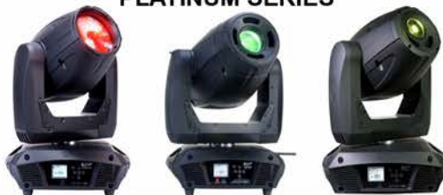
BEAM 5R | SPOT 5R PRO | SPOT 15R