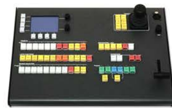
SCREEN PRO-II CONTROLLER