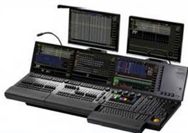
GRANDMA2 FULL SIZE