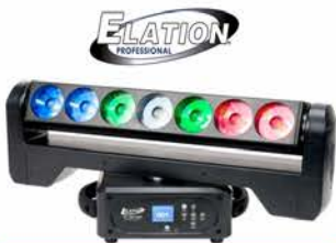
ACL BAR 360