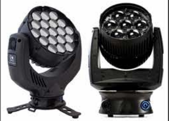
IMPRESSION X4 & X4S