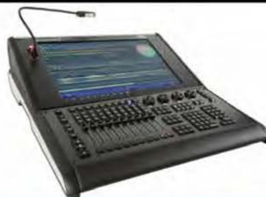
ROAD HOG 4