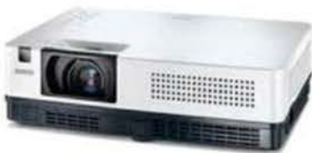
SANYO PLC-XR 2700LM