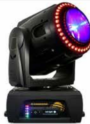
HIGH END SHOWGUN