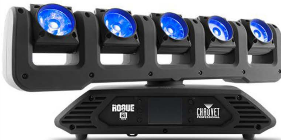
CHAUVET ROGUE R1 FX-B