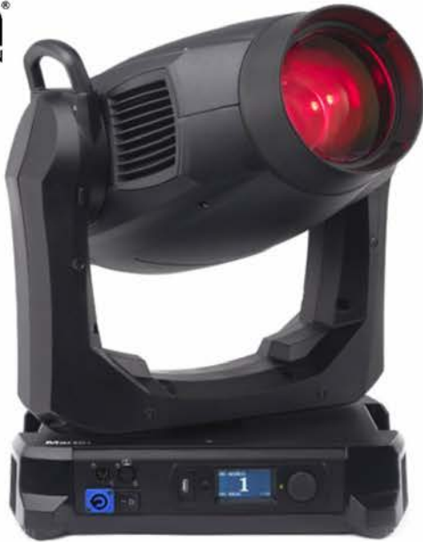
MAC VIPER PROFILE